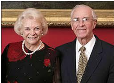
Retired Supreme Court Justice Sandra Day O'Connor

<a href="http://www.newser.com/story/73852/husband-of-retired-justice-occonnor-dies.html?utm_source=newser&utm_medium=embed&utm_campaign=story" target="_blank">img style="width:240px;border-width:0px;" alt="" src="http://img1.aazcdn.newser.com/square-image/73852-20110331211846/husband-of-retired-justice-occonnor-dies.jpeg"</a>